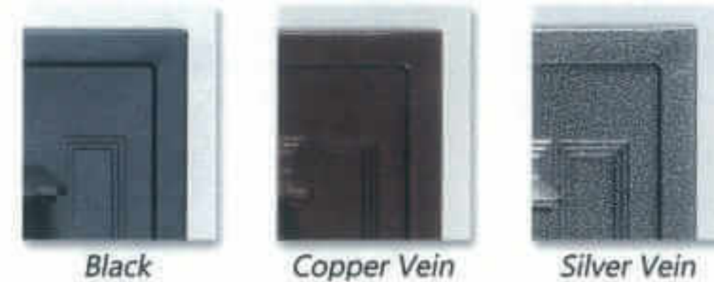
Black Copper Vein Silver Vein