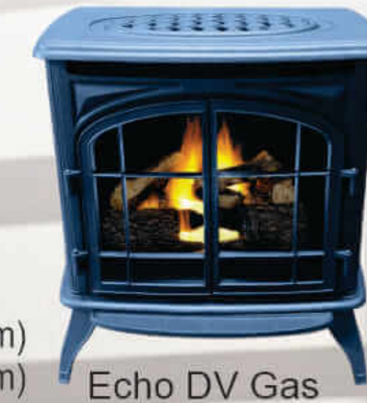
Echo DV Gas